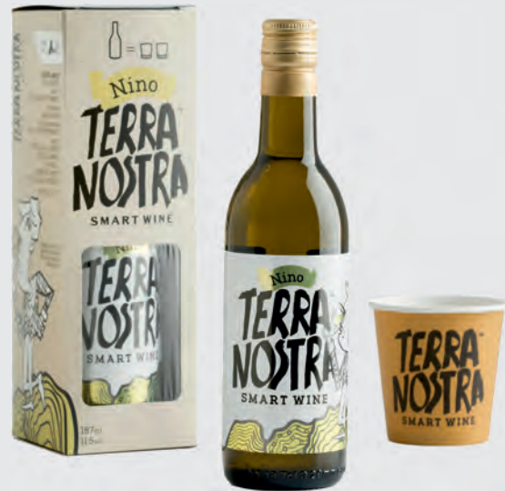
TERRA NOSTRA WHITE