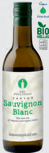
KARYOS GAEA white