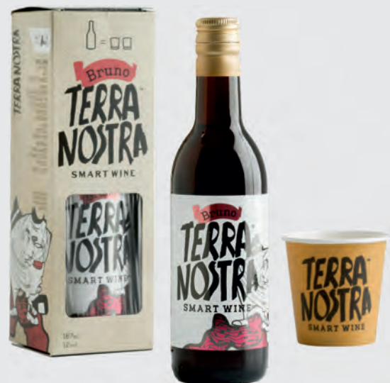
TERRA NOSTRA RED