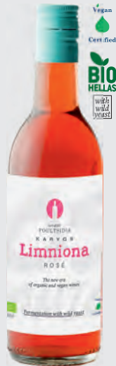
KARYOS GAEA rosé