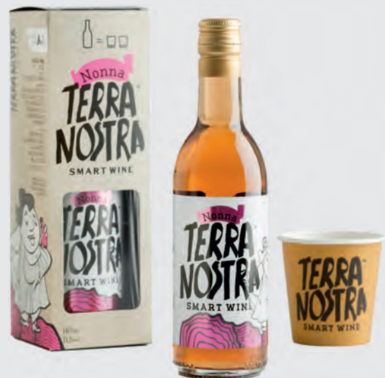
TERRA NOSTRA ROSÉ

In a unique package with a craft paper cup.