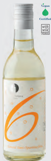
SIXTH SENSE VARIETAL WINE WHITE SEMI-DRY SPARKLING — 187ml —