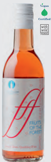
FRUITS OF THE FOREST VARIETAL WINE SWEET SEMI SPARKLING — 187ml —