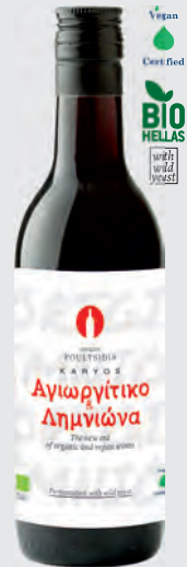
KARYOS GAEA red