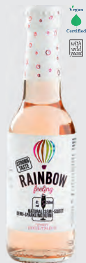
RAINBOW FEELING VARIETAL WINE NATURAL SEMI-SWEET SPARKLING — 250ml —